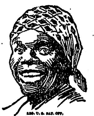
"I'm in town, Honey!"

Aunt Jemima Buckwheat Flour comes in a yellow package—the regular pancake package is red.