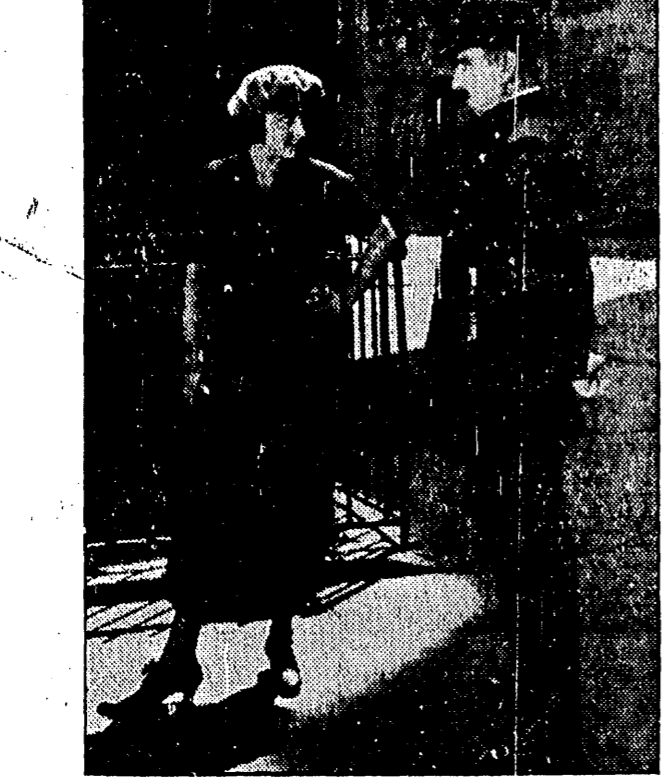
Dorothy Dalton in "The Moral Sinner" at the Hippodrome first half.