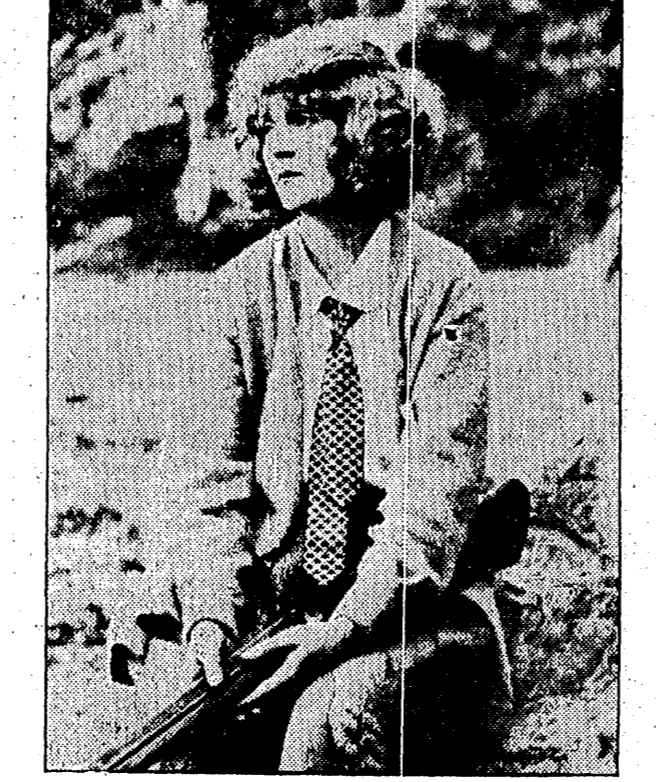
Mae Marsh in "Paddy—The Next Best Thing" coming to the Hippodrome Friday.