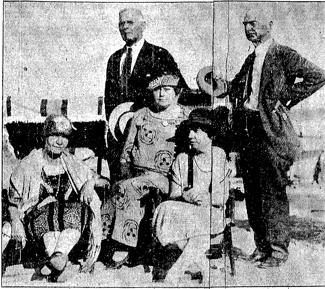
Among the many Pittsburgh visitors who are spending vacation at Hollywood are the above, photographed on the grounds of the new beach hotel.

was born amid song. Pagan religions have no such music and joy. They appeal to fear only. Some people say that Jesus wept but that He never laughed.